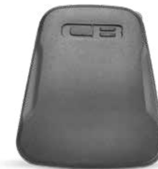
Tank Pad 01755K0Z910