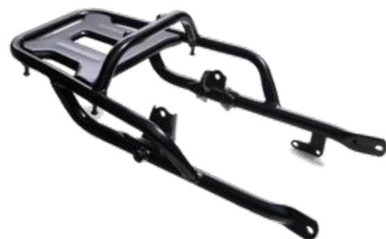
Kit, Rear Carrier 08U70K3RD00