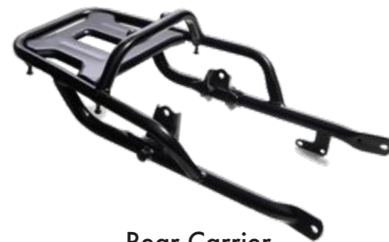
Rear Carrier 08U70K3RD00