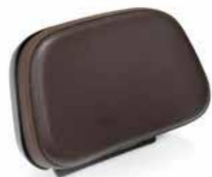
Back Rest 08R76K3RD00ZF | Brown 08R76K3RD00ZE | Black