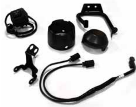
Fog Light Front Attachment 08V70K3RD00