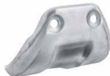
Skid Plate 087F6K0ZD10