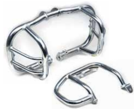
Kit, Engine Pipe 08F70K3RD10 | Chrome 08F70K3RD00 | Mat Black