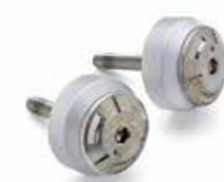
Grip End 08F79K0ZD10