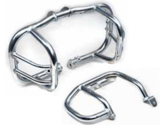
Kit, Engine Pipe 08F70K3RD10 | Chrome 08F70K3RD00 | Mat Black