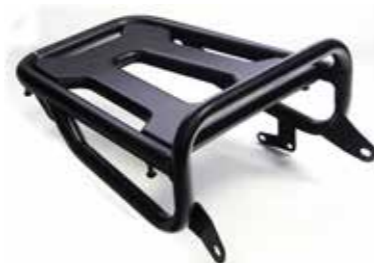
Solo Carrier 08L71K3RD00