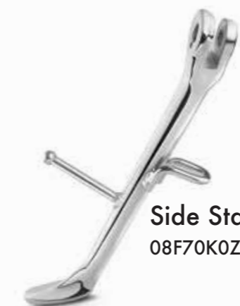
Side Stand 08F70K0Z911