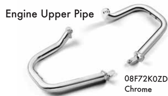
Engine Upper Pipe