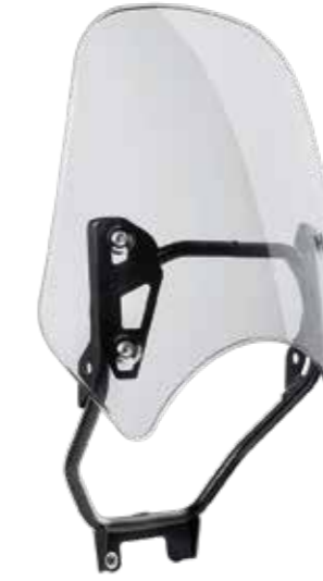
Kit, Long Visor 08R73K3RD00