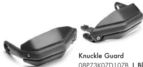
Knuckle Guard 08P73K0ZD10ZB | Black 08P73K0ZD10ZA | Orcus Grey 08P73K0ZD10ZC | Shasta White