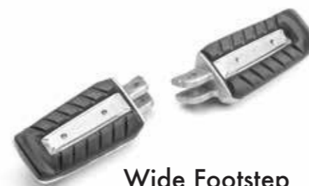
Wide Footstep 08R76K0ZD10