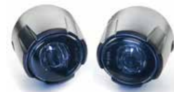
Fog Light 08V80K3RD00