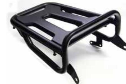
Kit, Rear Carrier 08L71K3RD00