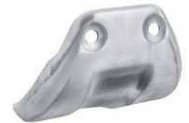
Skid Plate 08F76K0ZD10