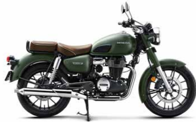
Mat Marshal Green Metallic