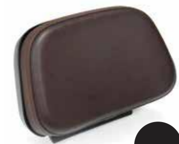
Back Rest Brown 08R76K3RD00ZF