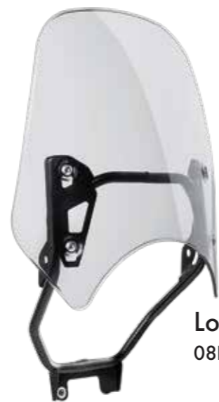
Long Visor 08R73K3RD00