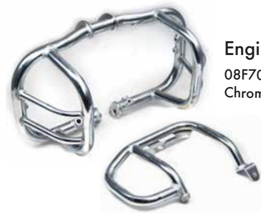
Engine Pipe 08F70K3RD10 Chrome

Ride on your CB350 with a wide range of accessories to choose from.