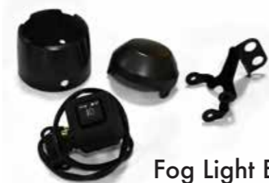
Fog Light Engine Pipe Attachment 08V79K3RD00