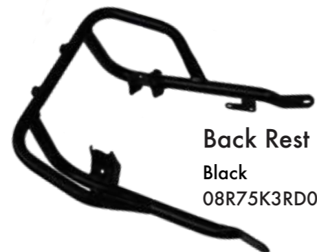
Back Rest (Bracket) Black 08R75K3RD00